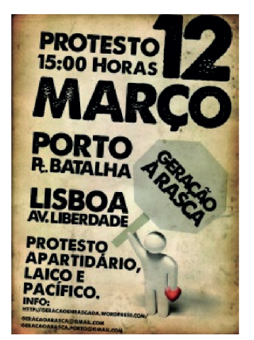
Figure 1: 12 March 2012 demonstration propaganda

Sociology of youth in particular and youth studies in general have always struggled to reconcile the classist and generational approaches in the analysis of young adults' trajectories, living conditions and social background, and have sometimes discarded one or the other for the sake of certain scientific, argumentative or statistical purposes, or due to national specificities or youth itself. For the classist approaches, generational differences are less important in comparison with the more relevant and politically important differences between social classes and positions, even within the same cohort or generational unit. For the generational approaches, social heterogeneity within the same cohort or generational unit, when considered, must not be detached from generational comparisons as proxy of a time metric capable of grasping social change.